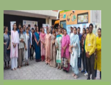
Mobile Food Testing Laboratory