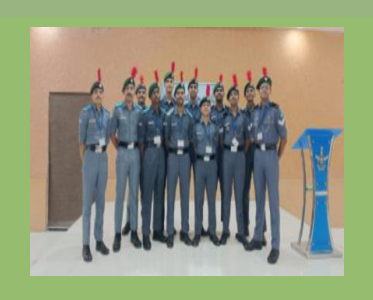
Air Wing cadets at the camp in Gwalior