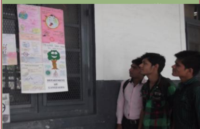
Students take a loop at displayed pamphlets/posters Language Department

On 9 and 11 April students of B.Sc. IV semester were shown CDs on environmental issues which are part of their syllabus of the Environmental Studies paper. The CDs are from the Center for Science and Environment, New Delhi. On 9 April the first part of 'Our Beautiful Planet' was shown, while on 11 April the students watched 'Changing Climates: The Future'. Various topics raised in the films were also discussed with the students. For the Knowledge Gallery, the department contributed a poster paying tribute to the great cartoonist R.K. Laxman.