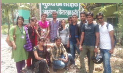
Madhya Pradesh Forest Department Visit Biotechnology Department