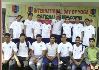
International Day of Yoga NCC Airwing Unit