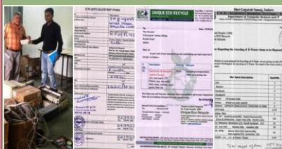
Department started E-Waste Management from Apr-2015