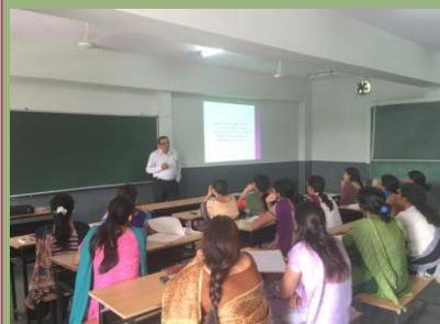
Faculty Development Program Microbiology Department