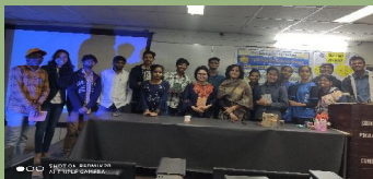
Quiz in association with Shabd Shilp