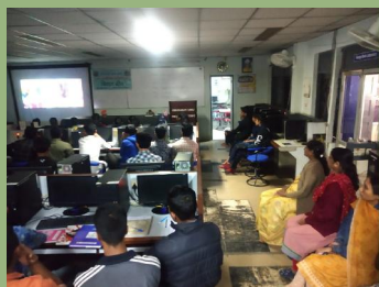
Students watching movie based on environmental concern