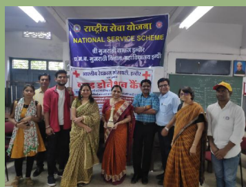
Blood donation camp