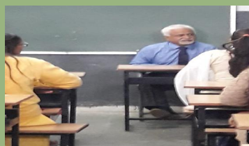
Expert Lecture in Zoology Department