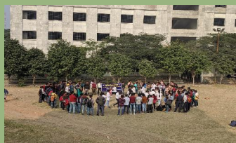
Students performing nukkad natak