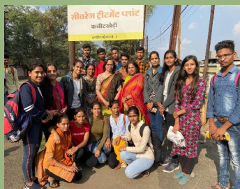
A visit to Sewage Treatment Plant, Kabit Khedi