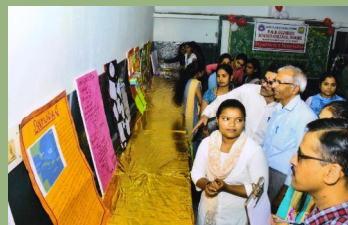
Poster exhibition in Maths Department