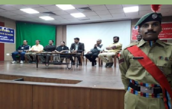
Kargil vijay diwas