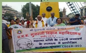
2 अक्टूबर को गाँधी जयंती के अवसर का चित्र