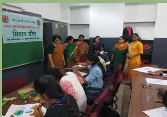
Poster making Competition Mission Green