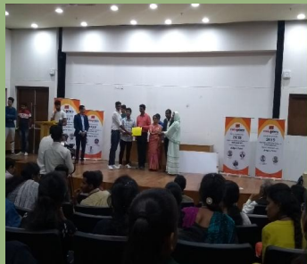
Students wet-lab championship at Hyderabad