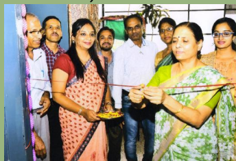
Inauguration of chart exhibition