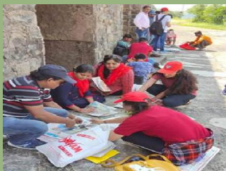
Students in Mandu