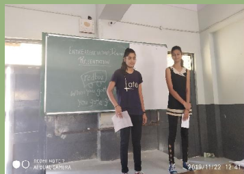
Students' Presentation on Startups