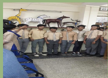
School students visited museum