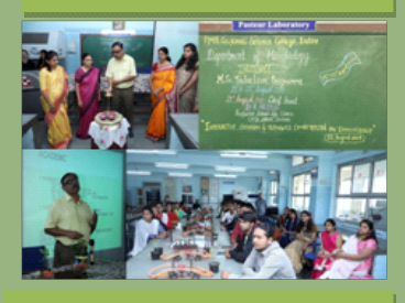
Microbiology Induction Programme