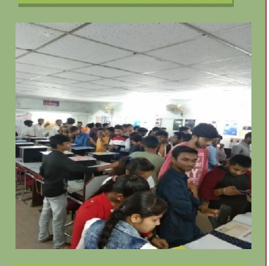
Chart Exhibition in Computer Science Department