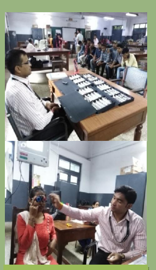
Eye Checkup Camp