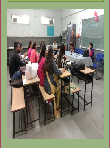
Induction Programme for P.G. Students