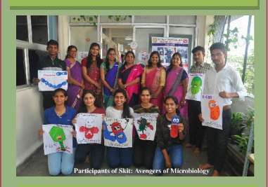
Micro Skit Participants