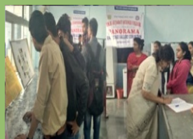
Students and Faculty members visiting Knowledge Gallery Exhibition