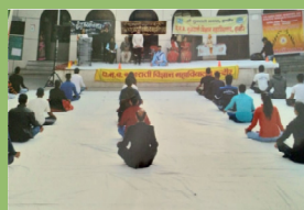
Samuhik Surya Namaskar