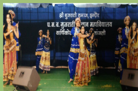
Students performing on Radha-Krishna Song in 'Kalanjali-2019'