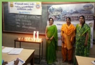
यू.जी. डेवलपमेंट कार्यक्रम-सृजनात्मक लेखन एवं कार्यशाला