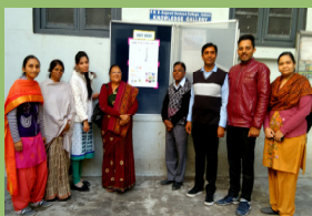
Display of Knowledge Gallery poster by faculty members