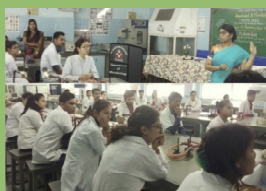
Student's attending a workshop: "Techniques in Pharmaceutical Microbiology"