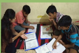
B.Sc. II year student teaching children at the NGO