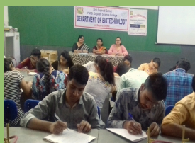
Campus Recruitment Drive for B.Sc. final year (BT 6 ) students