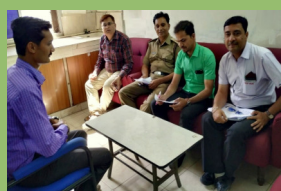
Student giving interview for the post of medical representative