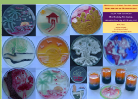
Agar Art Contest : Creativity Unlimited