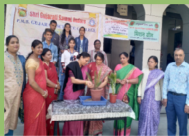
महाविद्यालय परिसर में पौधारोपण कार्यक्रम