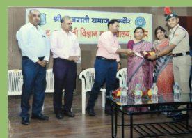
Annual Prize Distribution Ceremony