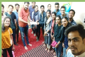
Jigyasa : Students contributing for tribal children at NGO Mrityunjay Bharat