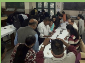
Expert talk and exhibition on Amazing Geology