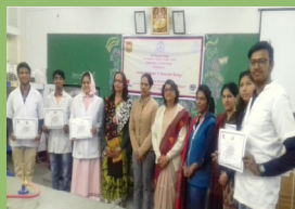
Students selected for the quiz competition at IIT, Kharagpur