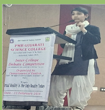
Participant : Inter-college debate competition