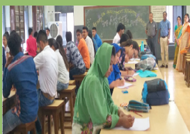
Poster making competition at Botany department