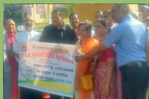
महात्मा गाँधी की 150वीं जयंती के उपलक्ष्य में वार्षिक कार्यक्रम का शुभारंभ