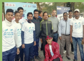
NSS students in Bicycle Rally organized by district administration