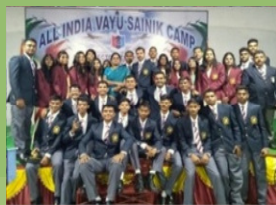
MP & CG Team : AIVSC-2018, Jodhpur