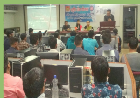
AIDS Awareness Programme organized in Computer Science department