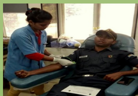
Blood donation camp at MY Hospital, Indore