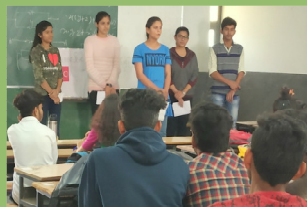
B.Sc. I year students making Entrepreneurship presentation