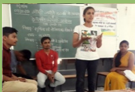
परिचर्चा : “शुचिता एवं नैतिकता का जीवन में महत्व”