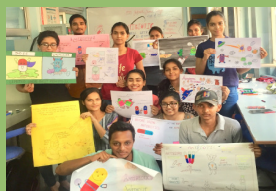
Poster and Slogan competition on "Antibiotic Resistance : A Global Concern"