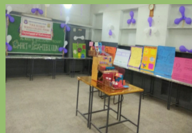
Chart and Model Exhibition organized at Mathematics Department