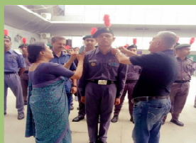
Rank Ceremony : NCC Airwing cadets