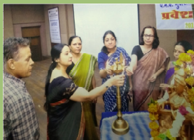
Lamp lighting: Induction Programme