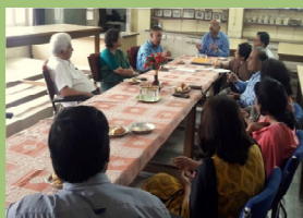
Meeting of Anti-Ragging committee members