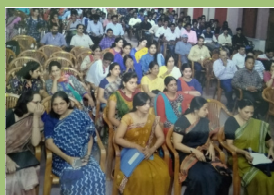
Induction Programme 'Praveshotsav 2018-19'