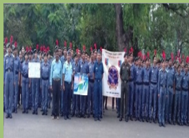
Inauguration of Prime Minister's 'Swachhata hi sewa' programme