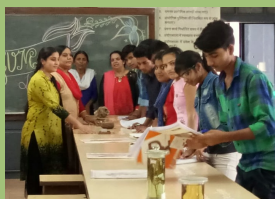
Teachers explaining about varieties of plant specimens to the students