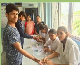
'Synergy' Peer Interaction Programme; Microbiology Department