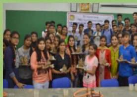
Eco-friendly Ganesha making workshop participants at Biotechnology department