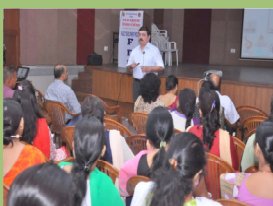
A talk by Shri Varun Kapoor, IPS on Cyber-security