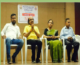
Kavya Paath on the occasion of Hindi Divas

Everything is either an opportunity to learn and grow or an obstacle that keeps you stuck. You get to Choose.