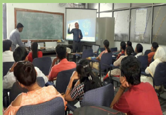
Lecture cum training programme in Chemistry department