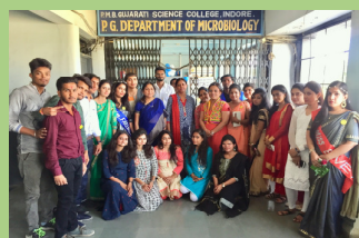
M. Sc. Microbiology students and Faculty members during Memoir, the Farewell Programme