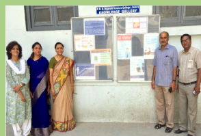
Poster Display by Career Guidance Cell members