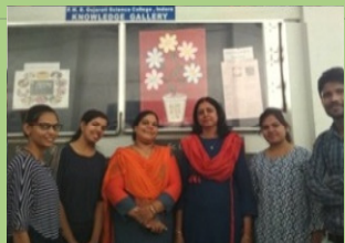
Display of poster in Knowledge Gallery under UGAD programme