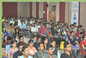
Students attending career guidance seminar on 16-02-2018