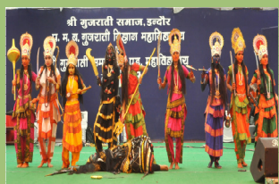
Students performing Mahishasur mardini in 'Kalanjali 2018'