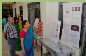
Panorama: Knowledge gallery exhibition