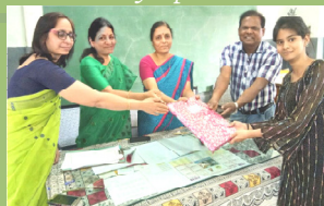
Winner of debate competition being awarded