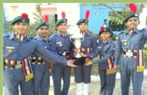
NCC Airwing cadets with IGC Trophy