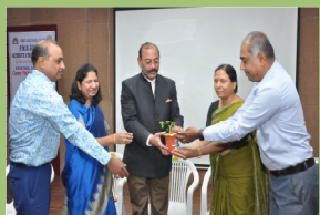
"Career guidance seminar" welcome of the chief guest & speaker