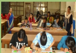
Slogan Competition in Zoology Department