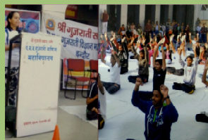
Samuhik Surya Namaskar