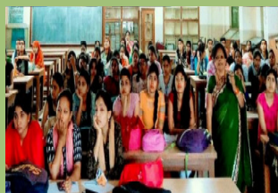
Smart-girl training workshop