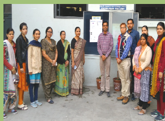
Display of knowledge gallery poster; Chemistry department