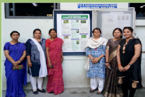
Display of knowledge gallery poster, Botany department