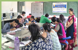
Pamphlet making competition on the topic "Road Safety or Death: Choice is Yours"