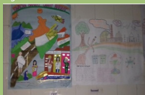
Poster-competition organized by Biotechnology department