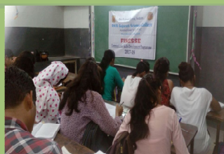
Students Involved in Finesse Activity