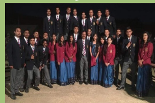
All India Vayu Sainik camp (AIVSC), Jodhpur