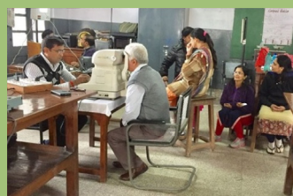
Eye-check up camp for students and staff