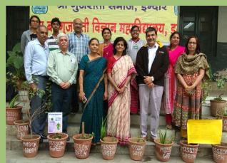
Plantation of Pollution Indicator plants