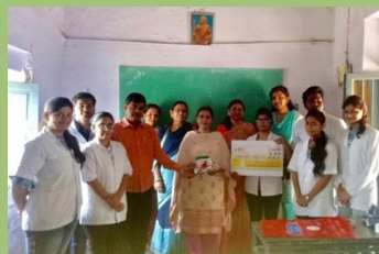
Celebration of Global Hand Washing Day at Shashikiya Madhyamik Vidhyalaya No.46, Indore