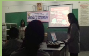
Seminar on Vaccine Preventable CANCERS