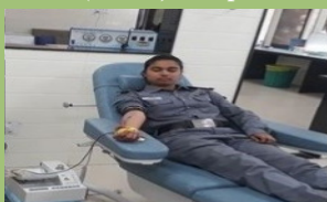
Blood donation by cadet at M.Y. Hospital organized on NCC day