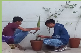
Environment Ambassadors at work