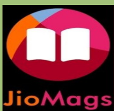
Computer Science department uploaded Perihelion on the JioMag App