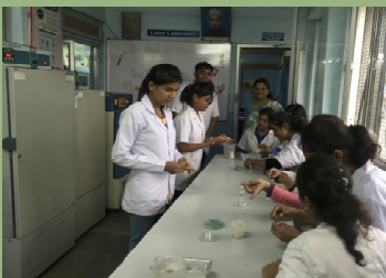
Synergy: Peer interaction programme- Blood group determination of B.Sc. I Year students