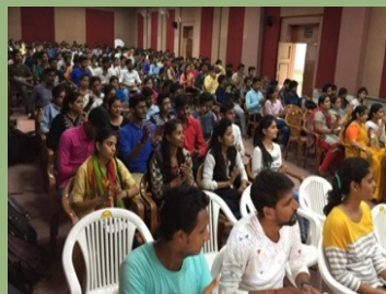
UG students attending Kavya-Paath