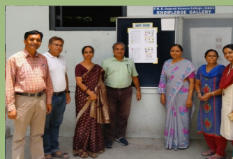
Knowledge Gallery Chemistry Department