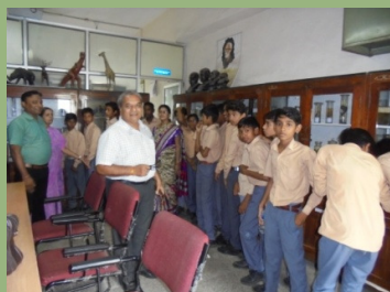
RRMB students of IX &amp; X class visiting Departmental Museum Zoology