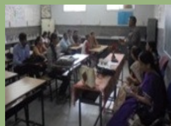
Parents-Students-Teachers meet for P.G. student's Previous &amp; Final year