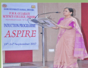
Induction Programme 'Aspire'