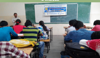
UG students giving Safal Yuva- Bharat exam organized by Vivekanand Kendra