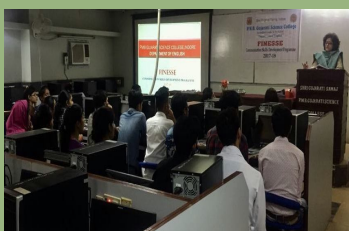
Inauguration of the certificate course 'Finesse'