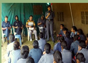
Students of II & III year participated CATC of Airwing NCC